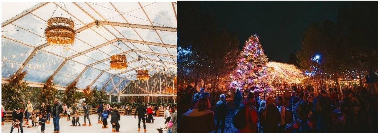
Image of the Ice Rink in the Elven Village

For safety reasons, assistance dogs are not permitted on Father Christmas' Frozen Pond. If you plan to ice skate, please arrange for someone in your party to care for the assistance dog during that time, as staff are unable to provide care. Please ensure a member of your party accompanies you or your child on the ice if needed.